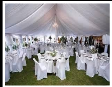
Mini Lights shown in photo with a chandelier