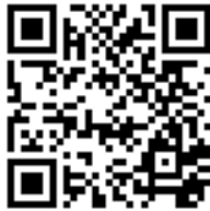
SCAN TO VIEW CHAIRS

___ Chair Tear-Down Fee (Optional when Picked up) .....Call for Pricing