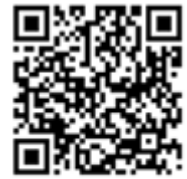
SCAN TO VIEW BARS & ACCESSORIES