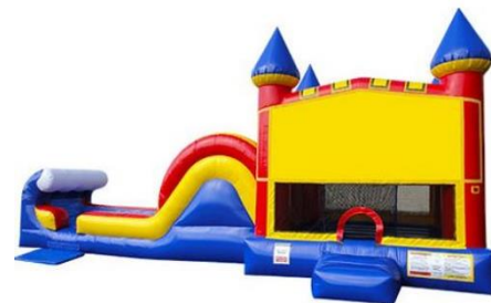
First Down Football - $275