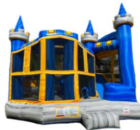
Orange Crush 5 in 1 - $325