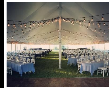
Commercial lights shown in photo