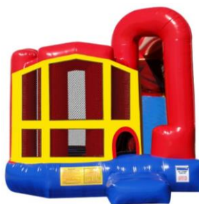
Backyard Combo - $300